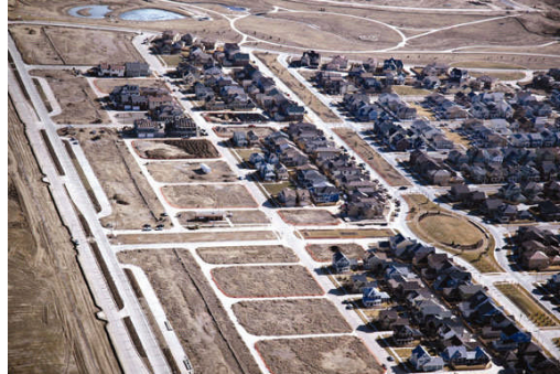
(Stapleton's Westerly Creek neighborhood in 2005)